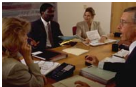
PEI works to truly understand all its clients needs

Objective: PEI is committed to ensuring the satisfaction of both clients and candidates. It is our goal to work in harmony with your